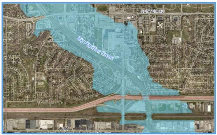
Inundation areas on Big Papillion Creek near 84th & I-80