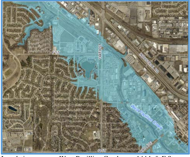
Inundation areas on West Papillion Creek near 144th & F Sts